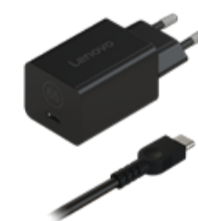
Lenovo GaN Nano 65W Adapter