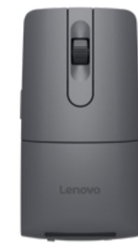
ThinkPad Bluetooth Presenter Mouse (Aura Edition)