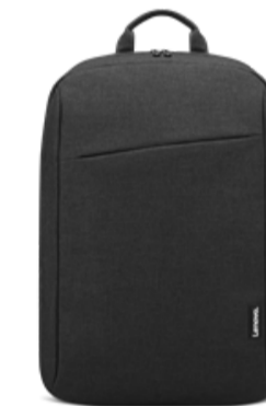
Lenovo 16-inch Laptop Backpack B210 Black(ECO)