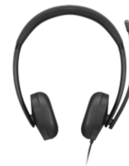
Lenovo Wired VoIP Headset 5000 (Teams)