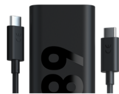
Lenovo 68W USB-C Wall Charger